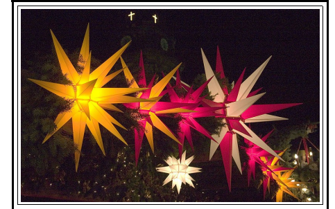
The Moravian Star (look up history)